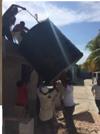
Putting the tank on the water house roof

4 hours evaporate waiting for this so Bertone and I went over and unscrewed the 1" fitting out of the tank and I held my hand over the hole to stop the water. The video shows a much livelier action which was over in 20 min. With the new