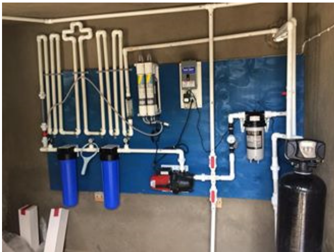
Completed system with iron filter on right

It's now 1:30 in the afternoon so I go to Sister and tell her I am going to purchase another tank as we're just not going to be able to use the other one for our source water. That would take another 3 hrs but Sister told us to use the one she had by the gate which has clean water in it for the patients waiting to see the doctor. The workers started emptying the tank by turning on the faucet and let it drain in a 5 gallon bucket to which they would put in a larger bucket. There was almost 500 gal of water in the tank and I could just see our next