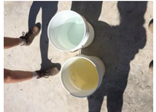
In about 15 minutes the water went from clear to yellow because the iron