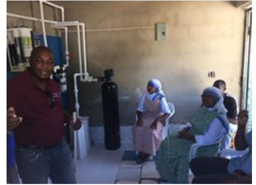
Bertone begins training