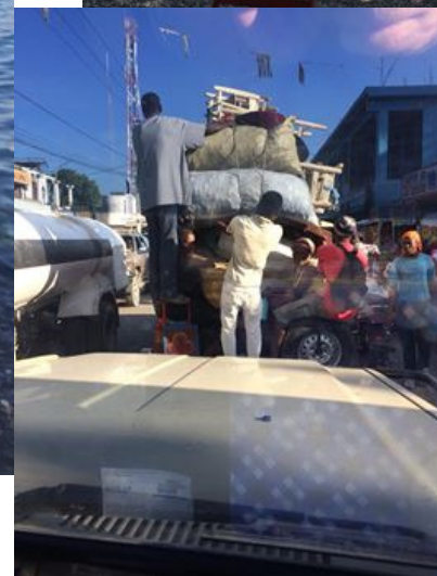
A typical Sat morning in the DuFort market

and no play so this was a little out of character for me. Amber and Renée taught the girls the precepts of swimming very well and while they weren't swimming they were floating and did feel quite