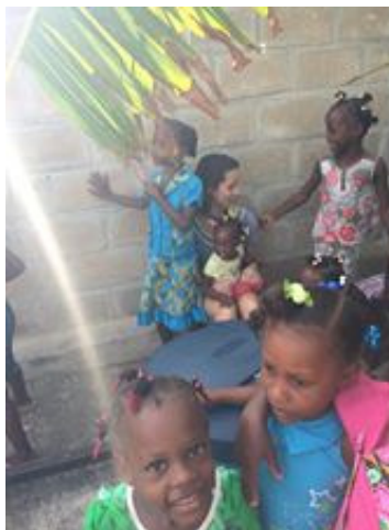
These kids are always clowns for the camera