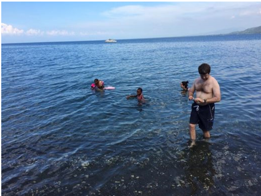
The ocean was like bath water and the beach was wonderful