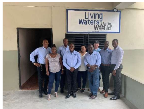
The LWW in country team in front of the Leogane office. There is no team better!!

The rest of morning thru 2p in the afternoon, I met with the LWW in country staff at our office in Leogane. There are 8 on this team that I am truly blessed to serve with. Each time I come to Haiti we always try to get together to review new things that are happening and better ways we can serve the pure water systems in Haiti. I always try and provide one item on some form of education and this session was Marketing Pure Water ,