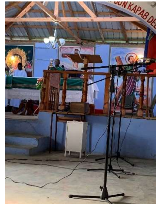
The Blood of Christ celebrated at St. Andrews in Dufort

We arrive at St Andrew and my opening prayer was since I would not understand the words that God would just fill me with His love. Their choir was 6 young men and women who had incredible voices, a bongo drum and a keyboard. When they began singing, I was flooded with this wonderful peaceful feeling. And it didn't leave until after I was out of the church. Prayer answered!