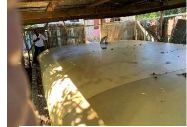
St. Michaels water bladder