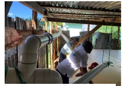
4" plumbing coming from two roofs to fill the bladder.

system from the rectory roof to the bladder. There is another building next to the bladder foundation that Pere Laguerre built with a lot of roof space so Bertone built another gutter system and ran it into the first one. Now it takes only 1 week to fill the bladder. On his own Father built a roof over the bladder to protect it from the sun which should preserve it for years to come. We commend Pere for this initiative as it shows how