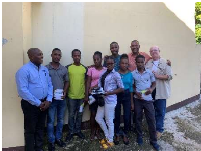
The PAV University students (7 of 9). This is the future of Haiti.