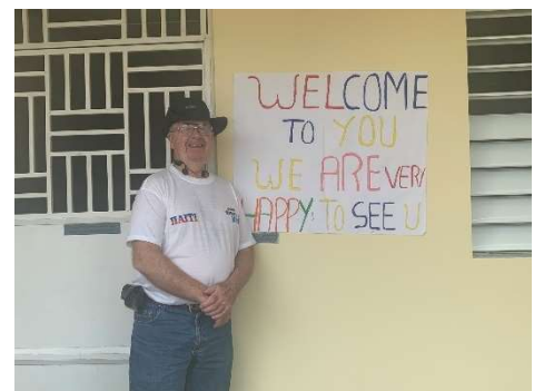
The girls always make me feel so welcome