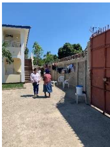
Saturday is wash day at NDC and God is the dryer.

Haiti Oct-10 I managed to get up at the appropriate time and made it to chapel on time. It is difficult for me to explain the peace I receive from praying the rosary and liturgy of the hours with the brothers. It is the highlight that begins my day. Breakfast was spaghetti, avocados, eggs and coffee. It was great and since we had an hour before our first appointment the conversation turned to Biden and Trump. There is great interest by the Haitians in our upcoming election but since they only hear the media's view, I had a lot of steering to do toward the truth. Great discussion.