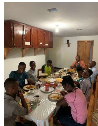
PAV University student at special breakfast in their honor with Fre Arie. These young'uns can put away some chow!