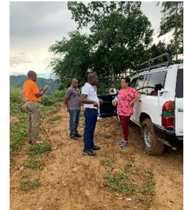
We went no further today. Note the mud on the tires. It is like ice and one wrong slide...